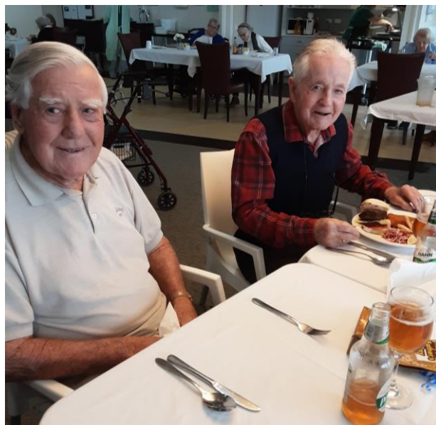
Father's Day celebrations