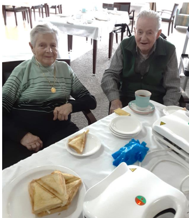
Making toasted sandwiches....