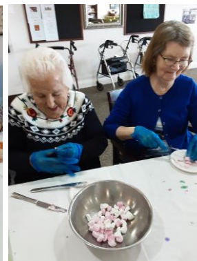
.....And Rocky Road