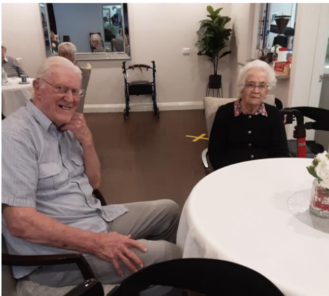
A cuppa in the café