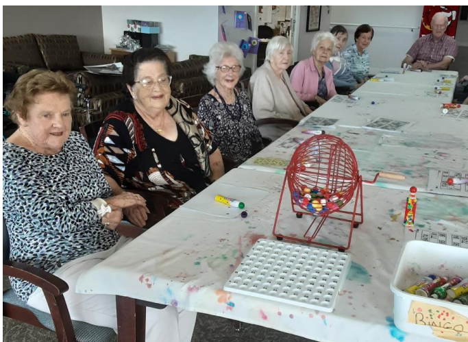
Eyes down for a full house!