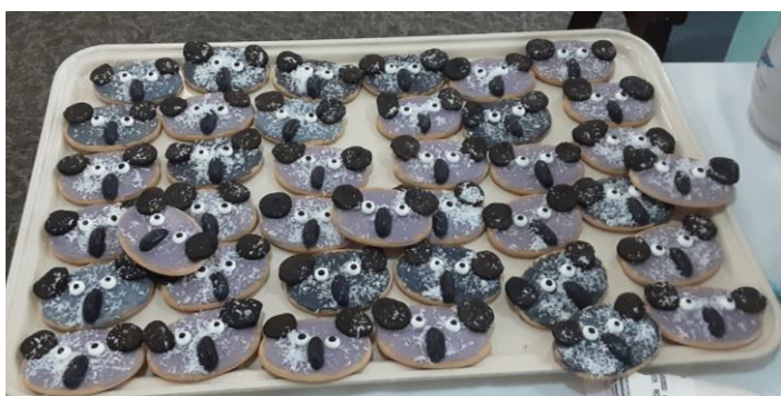
Making Lamington's and biscuits for Australia Day