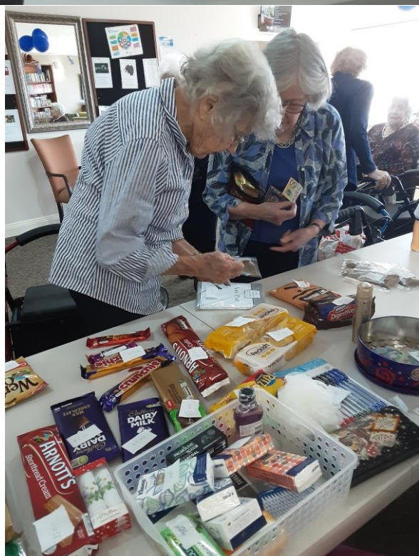
The Pink Ladies returned to the delight of many!