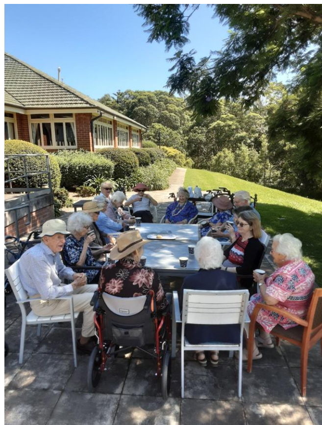
Walking Groups relaxing and taking in some sun and fresh air.