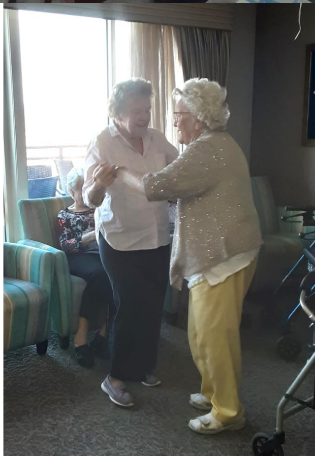
A great turn out for our Music Therapy