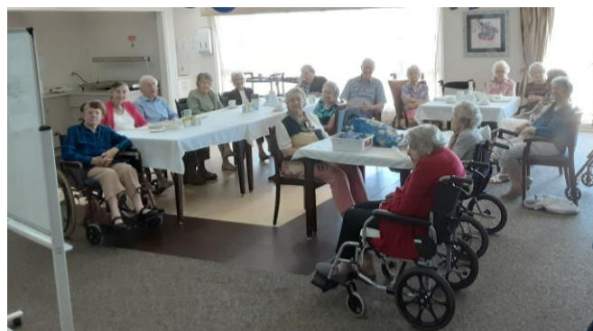
Find a Word