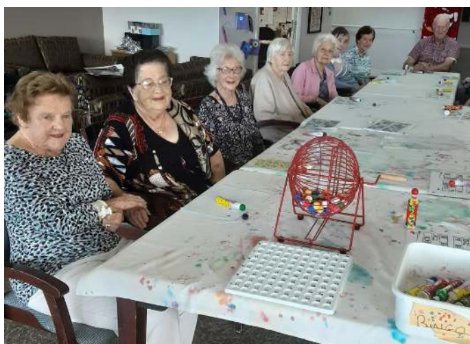
Eyes down for a full house!