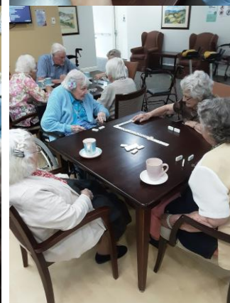
A great afternoon of Dominoes, Jenga and Uno with afternoon tea.