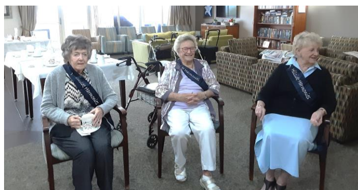
Some of newest members of the Hillside Harmonies