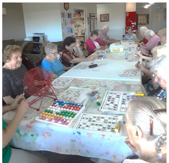
Fun and Games!