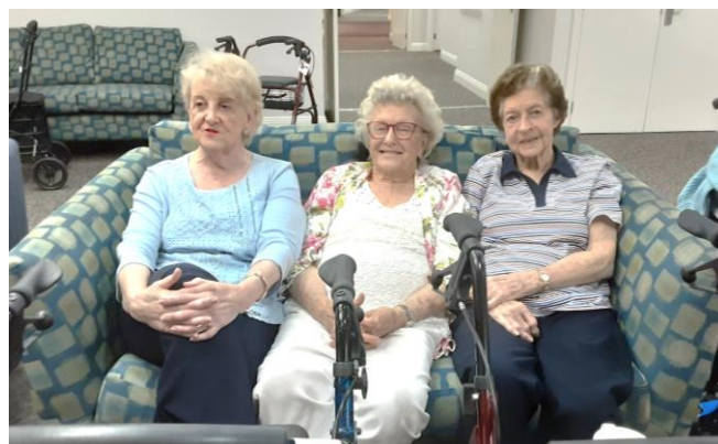
Music Therapy and a Cuppa to quench the thirst!