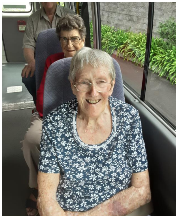
Bus trip to Mt Kembla up along Mount Ousley and down Bulli Pass