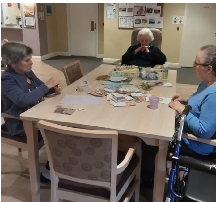
A lovely activity today for our ladies in the Lodge making and decorating gift cards.

Email: facilitymanager@greenhillmanor.com.au