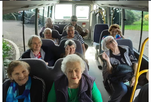
Music Therapy for the residents