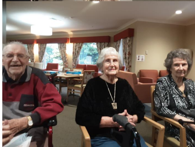
Greek Independence Day