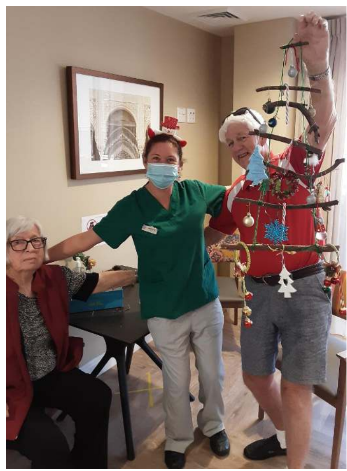
Making homemade Christmas decorations, don't they look great!