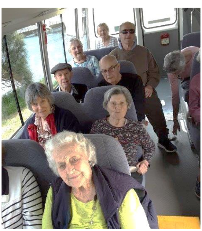
A great day out at Gerroa.