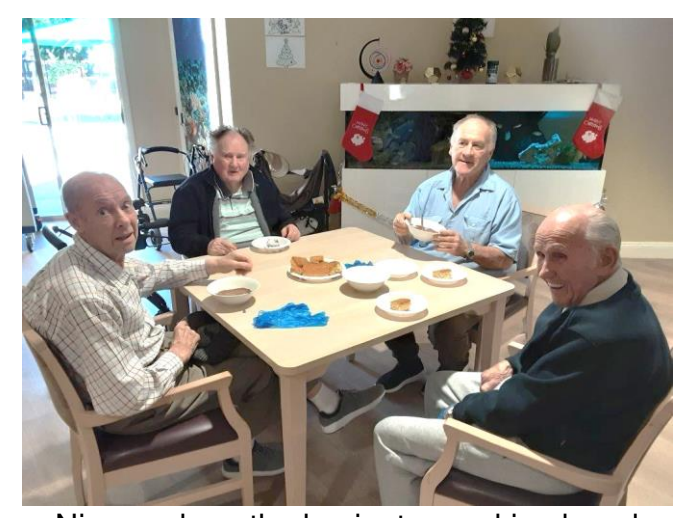
Nice work on the lamington making boys!