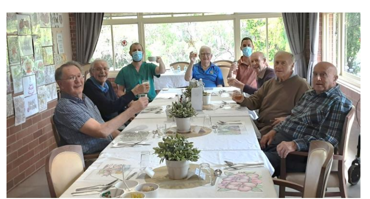
The last Men's lunch for 2020.