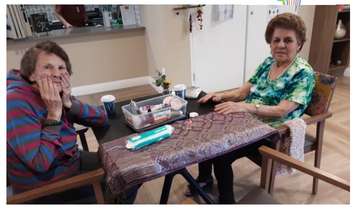
Another pampering session with our ladies.